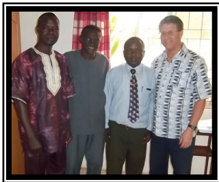
Meeting with 2 new members from Sierra Leone

“Servant leaders deliberately seek God’s counsel and share their questions”.