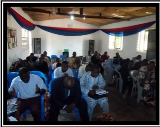
30 New Nigeria School Directors

Ghana—85 Nigeria—225 Togo—16 Benin—6 Sierra Leone—2 Ivory Coast—1 Liberia—1